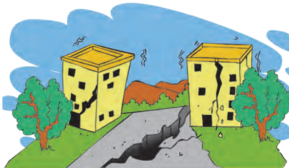
9.1 Cracks to the buildings

Everyday, earthquakes are noticed at some or the other places on the earth. According to the observation of 'National Earthquakes information center' every year nearly 12,400 to 14,000 earthquakes occur on the earth. ( Ref:- www.tris.edu .) From this it is noticed that earth is continuously vibrating.